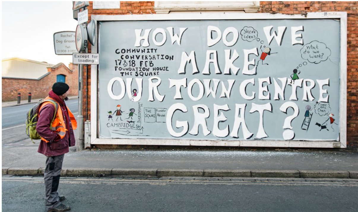
Billboard poster promoting a community engagement event in Wolverton

The seven pilot CIDs cover a wide range of local situations, partnerships, and activities. They are located in Hendon (Sunderland), Ipswich (Suffolk), Skelmersdale (Lancs), Stretford (Greater Manchester), Wolverton (Milton Keynes), Kilburn (NW London) and Wood Green (North London). They range from those led by a community anchor organisation such as Back on the Map in Sunderland, to BID led examples such as Wood Green and Ipswich, to local authority-led initiatives such as Kilburn. Some of the pilots aim to set up a CID as a new entity while others are hosted by established organisations. Three of the pilots are working alongside large shopping centre redevelopments.