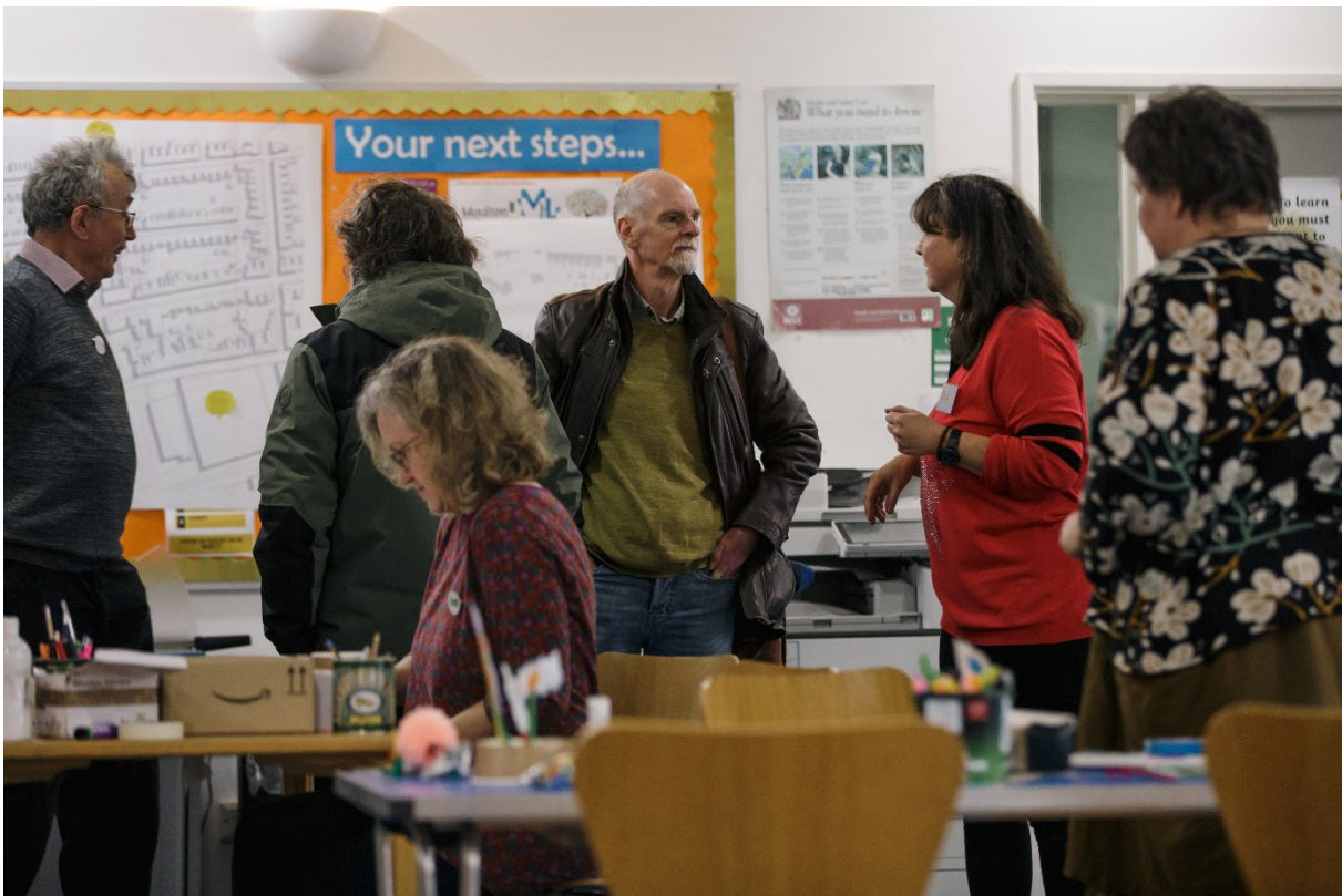
Local people discuss plans for Wolverton Town Centre